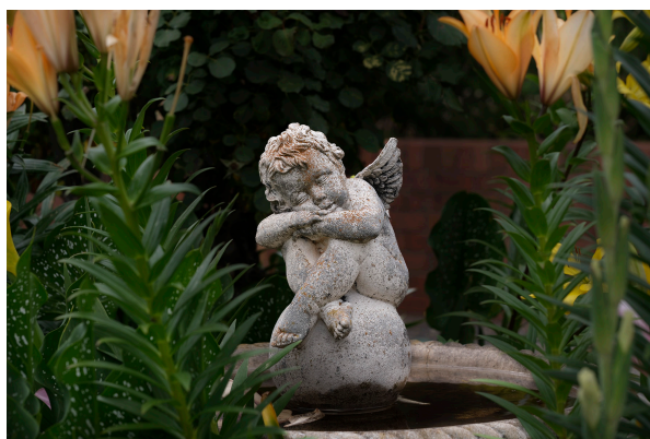
Image above by David Willis from Flower Photography Workshop at Malcolm Godde's garden.

We still have some available. If interested, please contact neville@nrbartlett.com.au