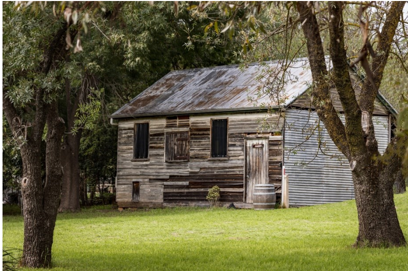
Merit ~ Old Lock Up ~ Patsy Cleverly ~ WACC