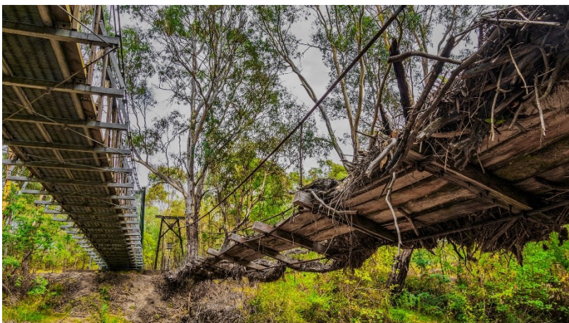
Merit ~ Swing Bridge ~ Geoff Bayes ~ WACC