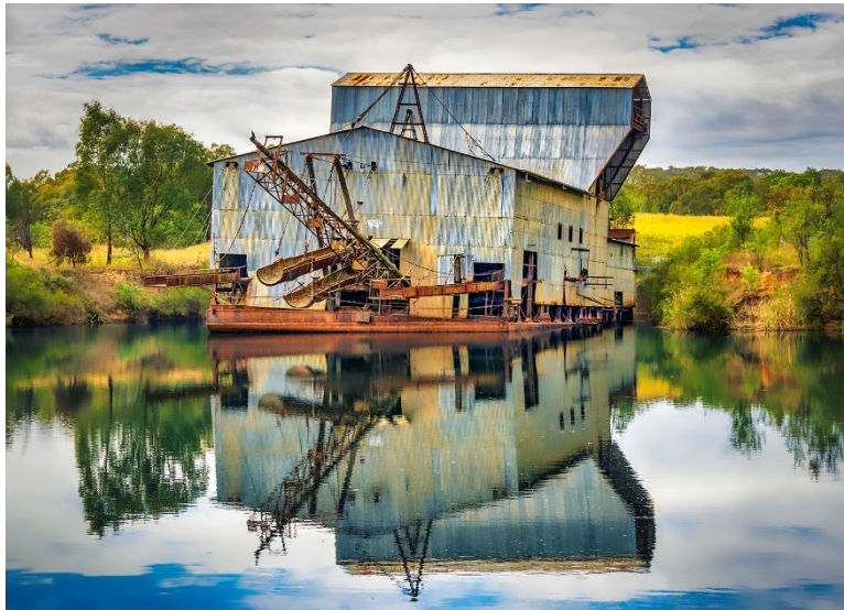
Second Place ~ The Dredge ~ Geoff Bayes ~ WACC