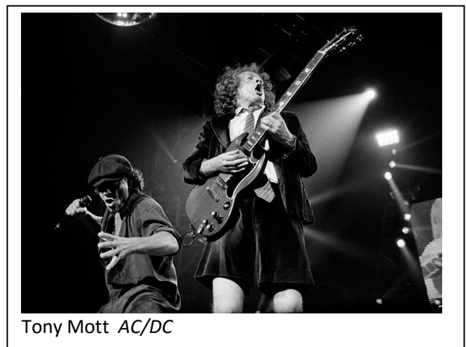
AC/DC