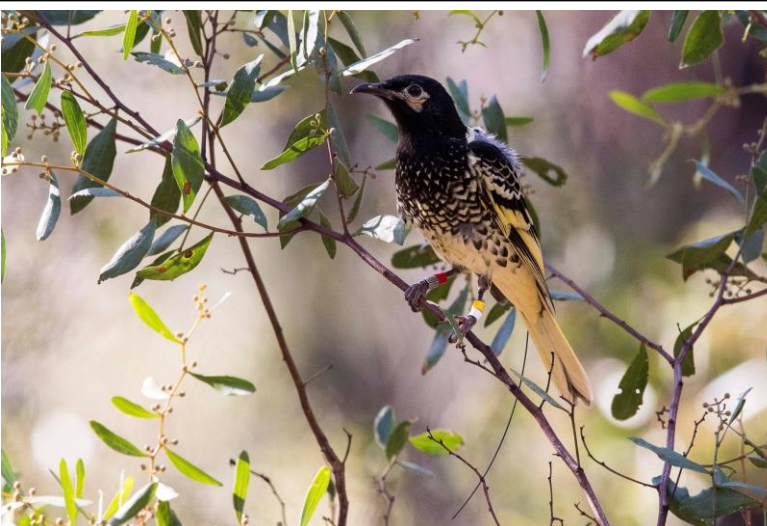
Neville Bartlett Regent Honeyeater (yellow/white) showing bands and transmitter

Each year, captive-bred birds from earlier releases have been recorded breeding with wild birds, so there is some hope for saving the species in the wild."