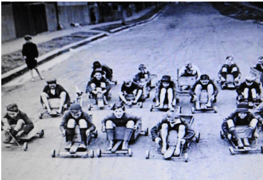
Ready to Race.....1928