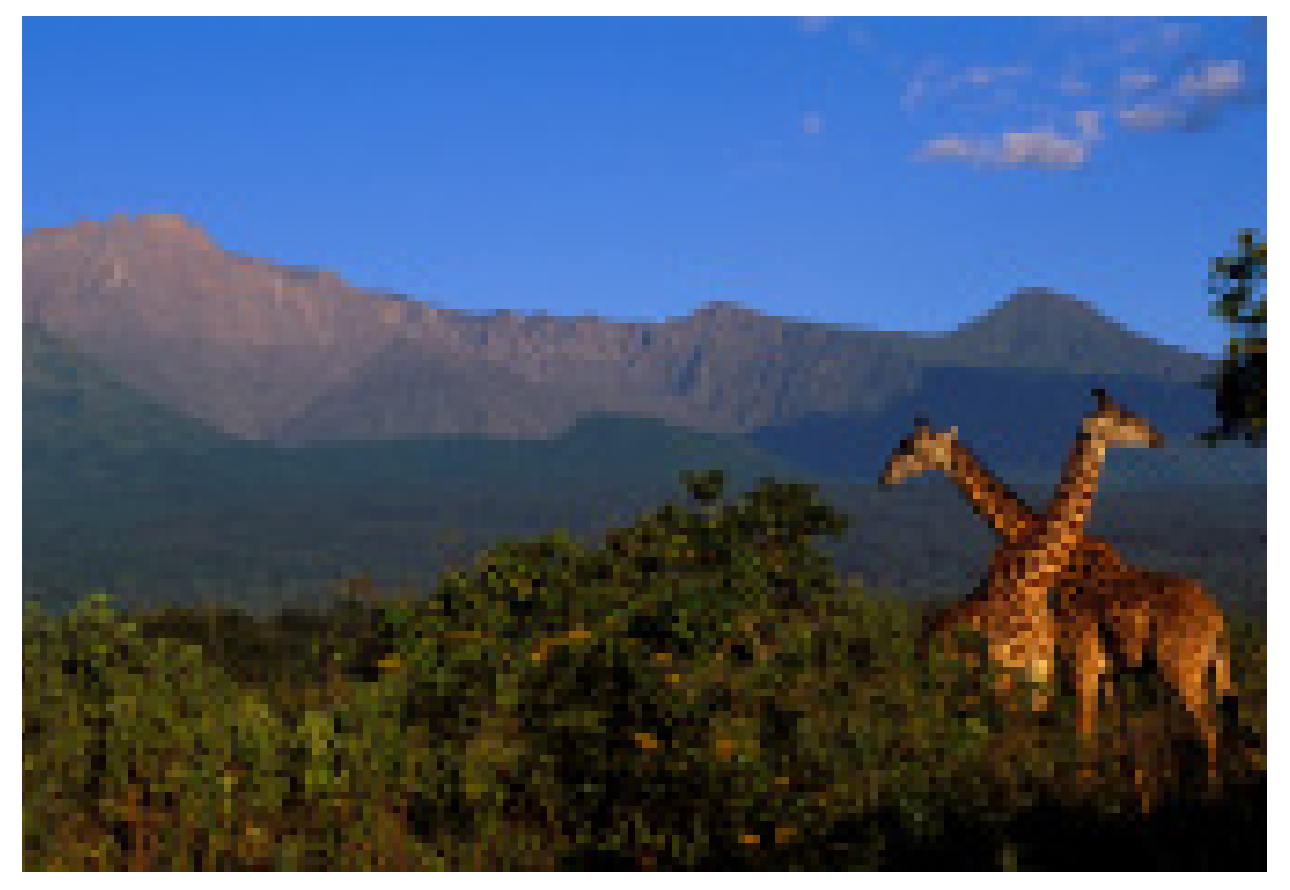
Balazs Buzas/National Geographic My Shot Tanzania

Close-ups are better if there's a catch light in the eye. Try shooting late or early in the day with the animal facing the sun. Or use a flash set on a dim, fill-flash level.