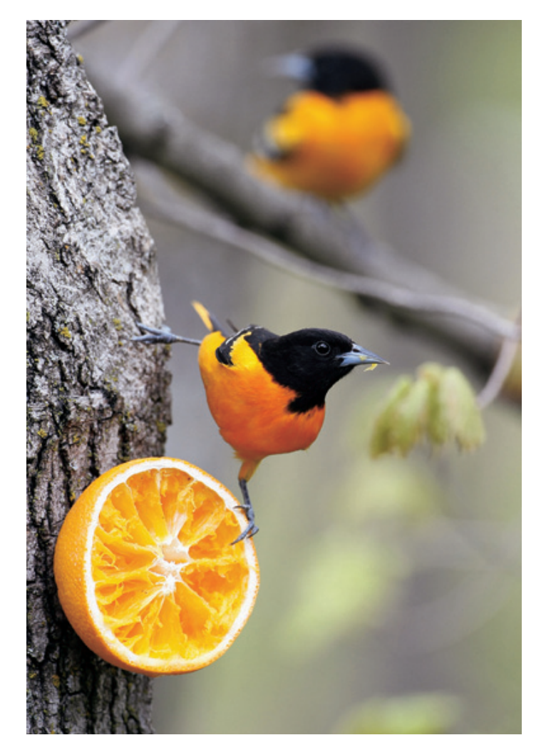
THE BALTIMORE ORIOLE investigating an orange in the foreground clearly this photo's focal point—creates an energetic counterweight to the bird out of focus behind.

Always think about what you are trying to say with an image. If you are making a photograph of an isolated farmhouse on the prairie, it must be large enough so that people can see what it is, but it shouldn't fill so much of the frame that the viewer loses the sense of its environment.