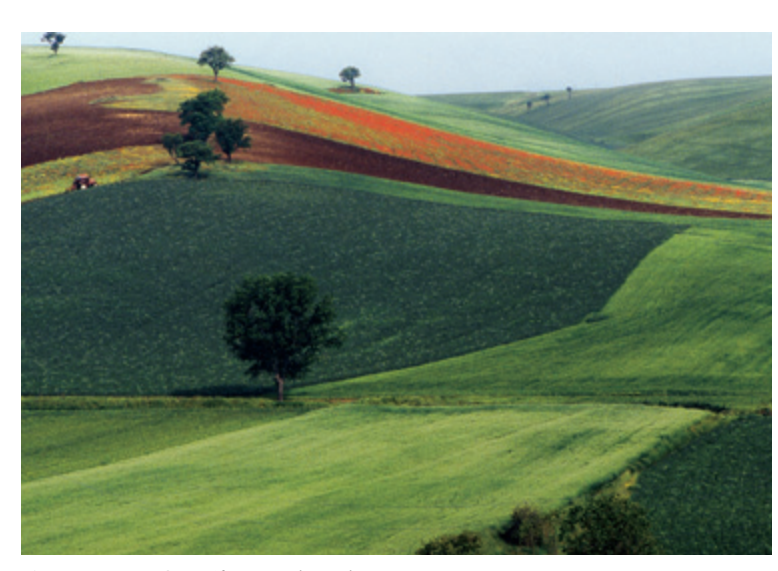
Puglia, Italy

In every carefully considered photographic accomplishment, four elements are vital: subject, composition, light, and exposure. In this book, we will use the shorthand of the icons below to highlight the choices that make a successful photograph.