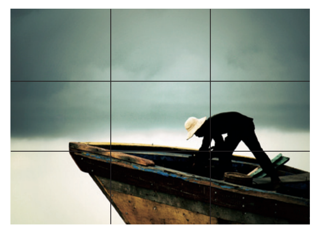
IMAGINE YOUR PHOTO divided by lines into nine parts. Composition works best when the focal point occurs near one of the "sweet spots" where lines meet. Yves Schiepek/National Geographic My Shot Vietnam

>> To get an idea of how effective off-center composition is, glance at some magazine covers. You'll notice that the subject's head is usually in the upper right of the frame so that our eyes travel first to the face and then left and down.