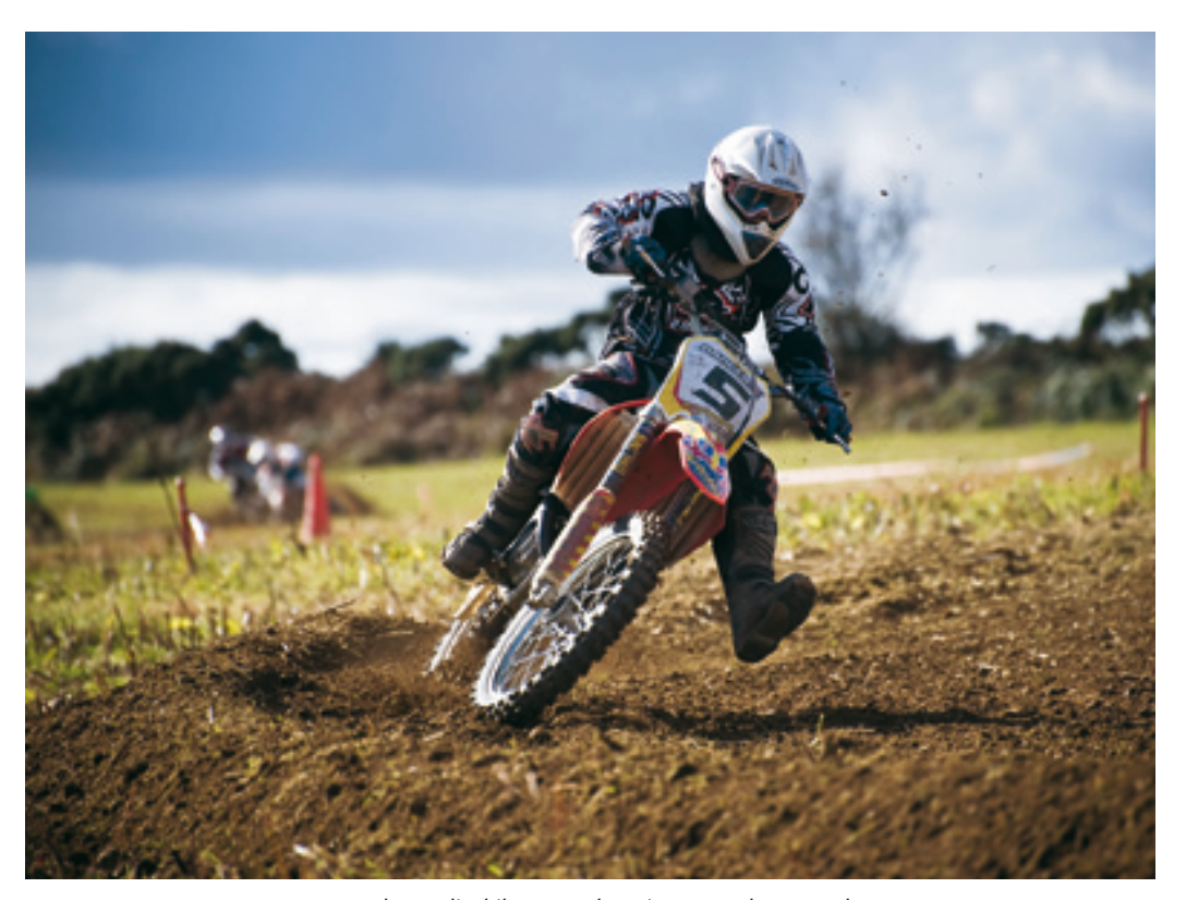
FREEZING ACTION MIDSTREAM—as when a dirt bike racer slows just enough to round a corner—can reveal details missed by the naked eye. Isle of Man, U.K.

Look for a composition that reveals something about the place as well as the person.