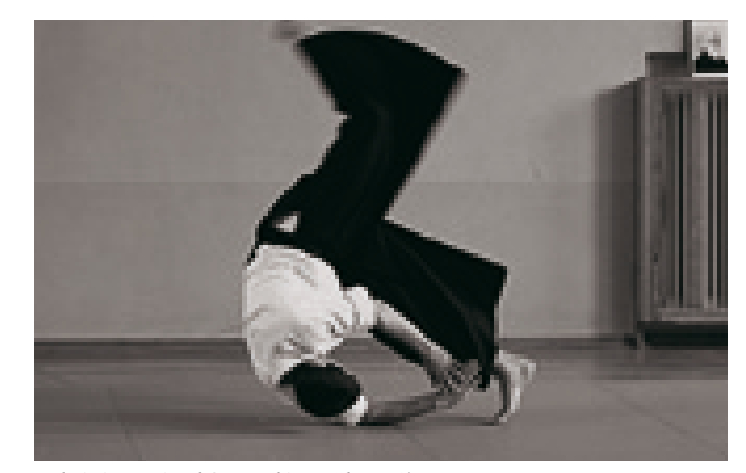
Andrej Pirc/National Geographic My Shot Slovenia

BLACK-AND-WHITE PHOTOGRAPHY allows the photographer to present an impressionistic glimpse of reality that depends more on elements such as composition, contrast, tone, texture, and pattern. In the past, photographers had to load black-and-white film in the camera. But with digital photography, you can convert your color images on the computer or, on most cameras, switch to black-and-white mode—good for practice but not the best for quality.