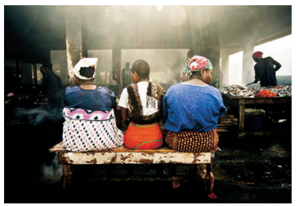
Chasen Armour/ National Geographic My Shot Tanzania

Since we usually look for details, it can be harder to see blocks of color or shape. Squint a bit. Details will blur, and you will see things as masses.