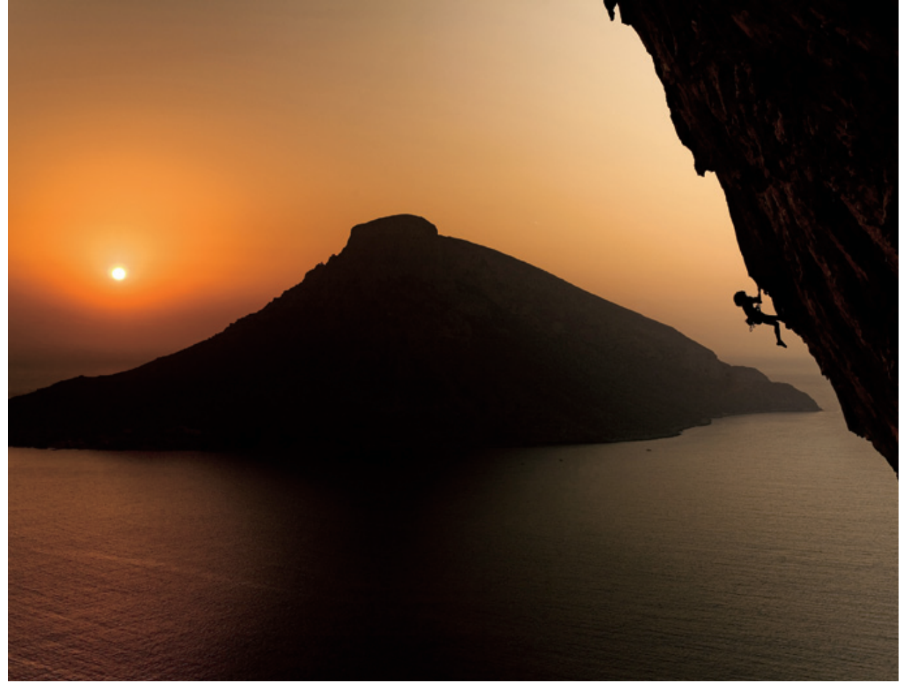
Lukasz Warzecha/National Geographic My Shot Greece

When shooting portraits, try backing up a little to include the environment around the person.