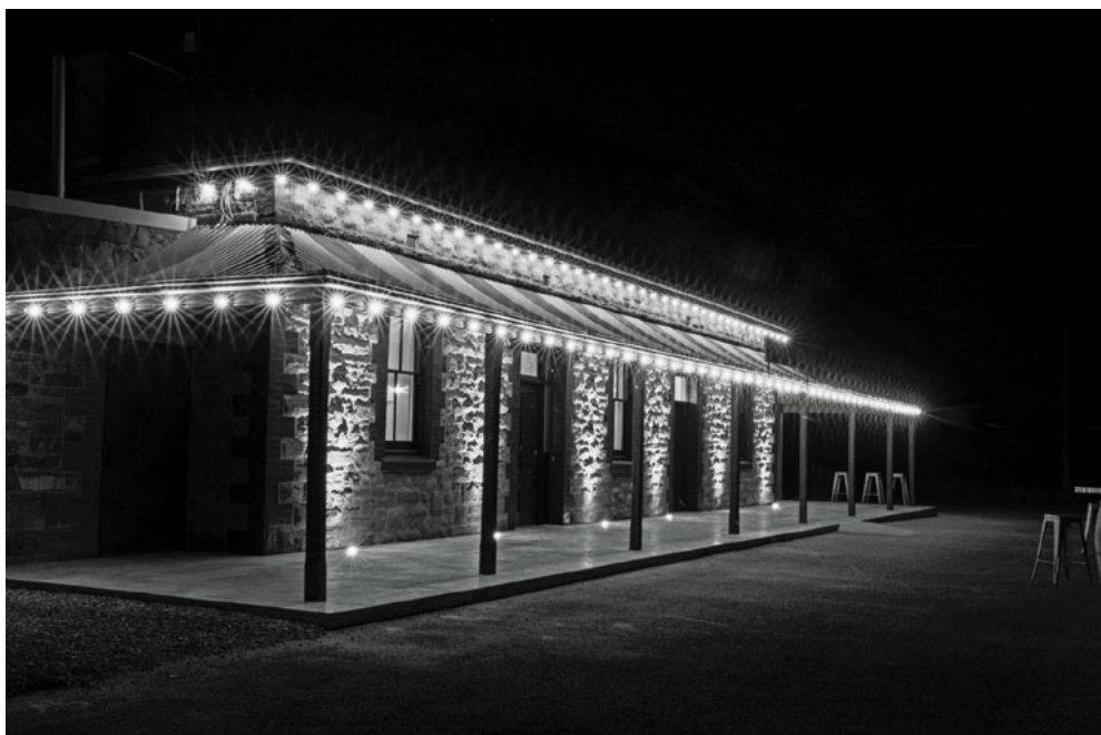
Above image: 'Outback Pub' by Pam Milliken 13 sec exposure; ISO 120, f 18

Well, there's a story! I admire Pam's effort to head back out with camera and tripod to capture this nice image after an evening like that one.