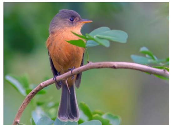
St Lucian Peewee