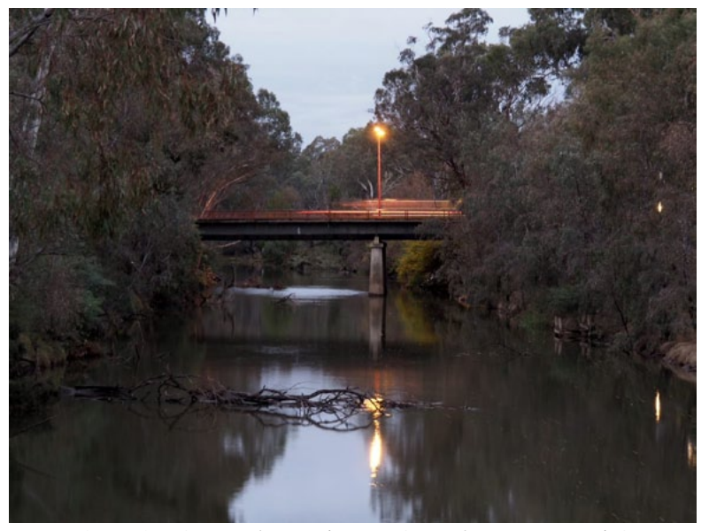
Image above: by Sharon Alston taken on the early morning workshop with Ian Rolfe at the VAPS Convention in Wangaratta (Ovens River).