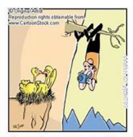
"Pretend you don't notice him."