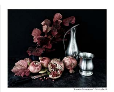
48<sup>th</sup> Warragul National Photographic Competition 2021

Entries open early January, 2021 Close 17th March, 2021 www.warragulnational.org