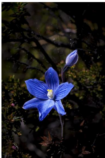
Wildflower images by Wendy Slater