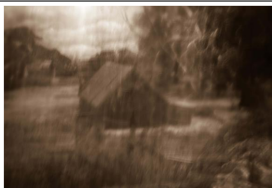
Wallace Hut in Sepia Louise Peacock