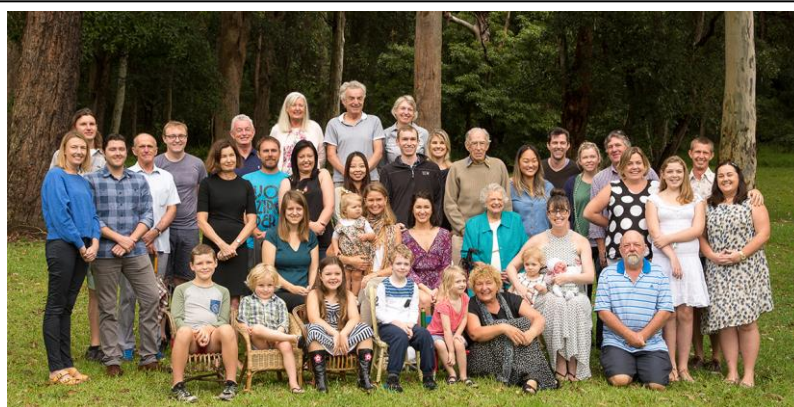
Lindsay Family Album