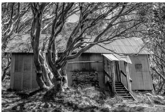
Cope Hut Garry Pearce