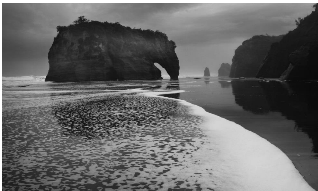
Tongaparutu Beach (Jillian Hancock)

This is the story behind Tongaparutu Beach . “After we had returned home from the North Island I saw pictures of the rocks off Tongaparutu Beach and knew I wanted to go there. We had to collect our van from Hamilton when we returned so we took a detour on our way south. It was a place you had to get to at low tide and of course that was at sunset on the day we were there. It was also very grey and threatening rain. We hung around waiting for the water to drop and finally headed off when it was still knee deep. When we got to the beach the rock formations were just as good as I hoped for and the dark sky actually added to the atmosphere. The rain held off until our return.”