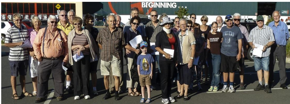
In the Beginning

Details regarding the 12 tasks are available on the website, but ... Beware! There be dragons ... or at least one.