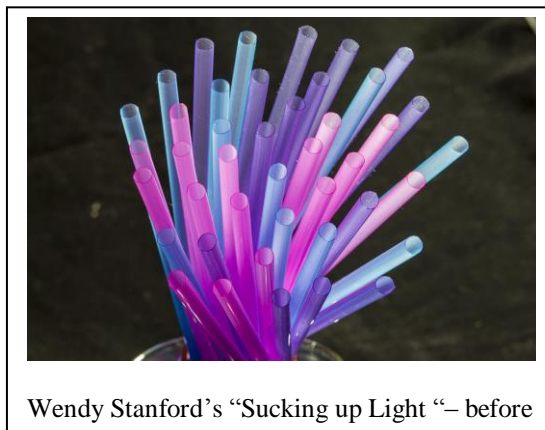
Wendy Stanford's "Sucking up Light" – before

"I had to play around with the depth of field to make sure all the straws were in focus, the exposure time and the amount of light coming into the straws."