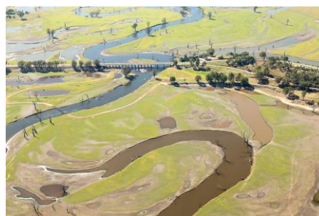
Tallangatta Valley (Garry Pearce)