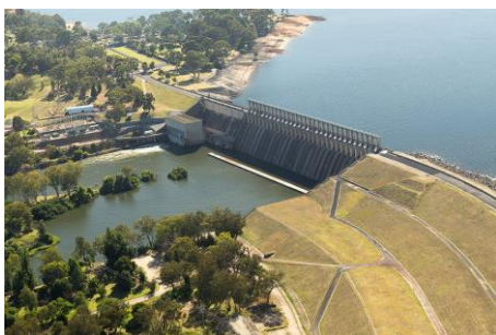
Hume Weir (Garry Pearce)

Vibration is an issue. Despite the temptation to have the lens resting on the window to cut down reflections and/or glare, don't let the lens, or any part of your hands/arms/elbows, touch the any part of the plane, especially the window. The vibrations of the plane will affect your image.