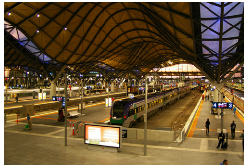
Spencer Street Station (aka Southern Cross)

Contact Pat or Audrey Stenson on 6040 5446