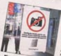
No cameras allowed: the sign banning photos.

Photos prohibited in tourist precinct of obscure things, and they were approached by security staff, which